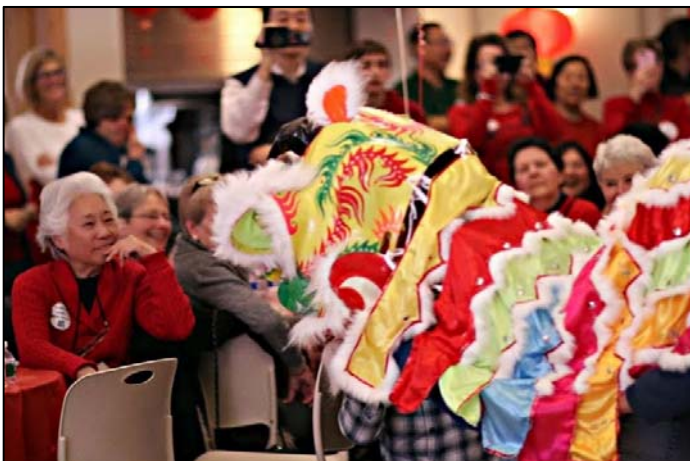
30 local Chinese families organized a Chinese New Year fundraiser in February, with over 250 people gathering to raise over $14,000 for the new library.

Once completed, the new library will operate with no net increase to taxpayers.